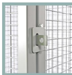
Hasp & Staple Locking