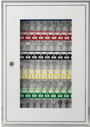
System 50 Key View