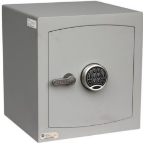
Mini Vault 3 S2 Silver Electronic Locking