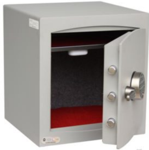
Mini Vault 3 S2 Silver Electronic Locking