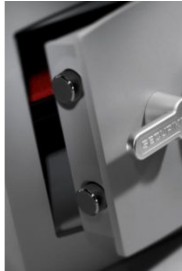
Mini Vault Bolts & Handle