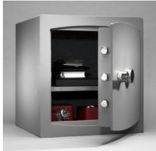
Mini Vault 3 S2 Key Locking Safe