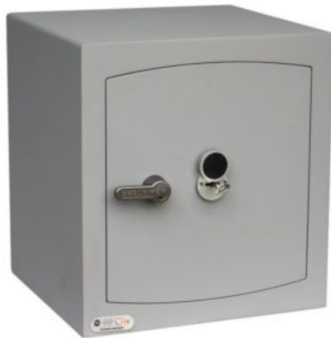
Mini Vault 3 S2 Silver Key Locking