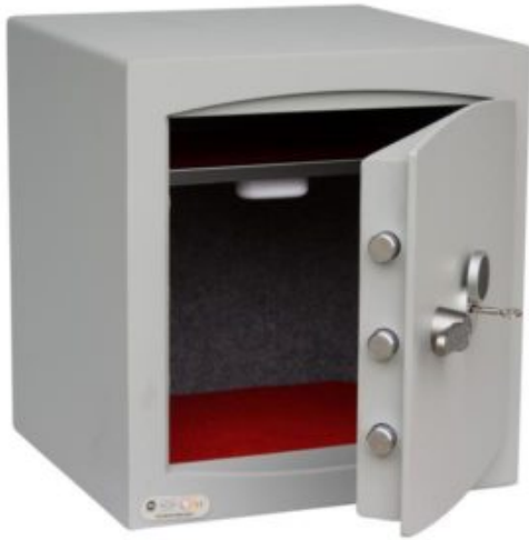
Mini Vault 3 S2 Silver Key Locking