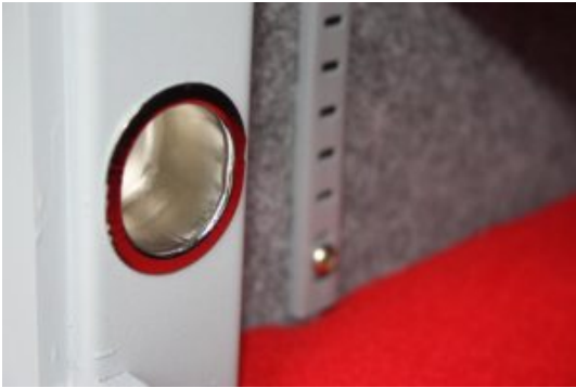
Mini Vault Chrome Bolt Cup