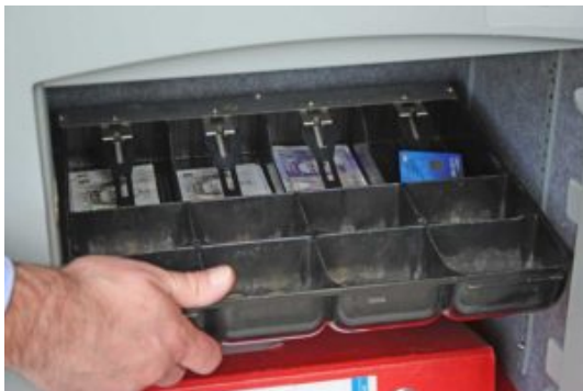
Mini Vault 3 & Till Draw