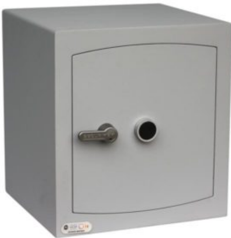
Mini Vault 3 S2 Silver Key Locking