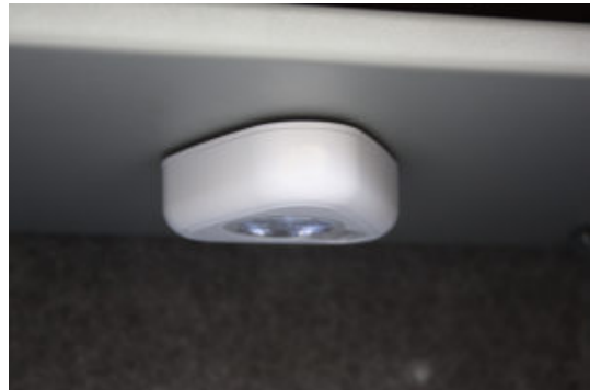
Motion Activated Magnetic Light