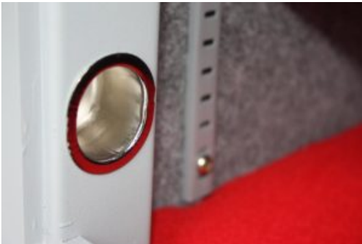
Mini Vault Chrome Bolt Cup