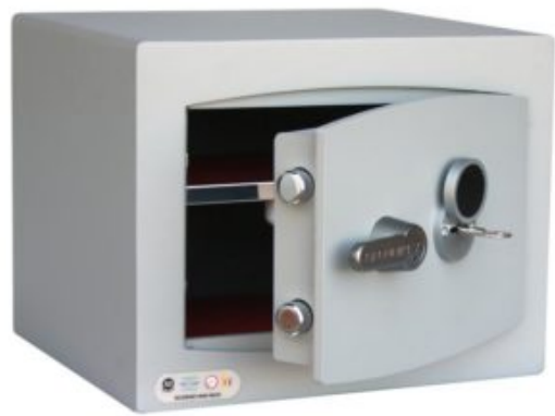
Mini Vault 1 S2 Silver Key Locking