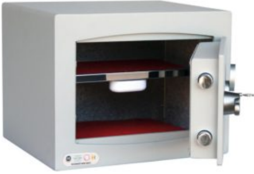
Mini Vault 1 S2 Silver Key Locking