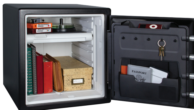
1 Hour Digital Fire Safe XX Large