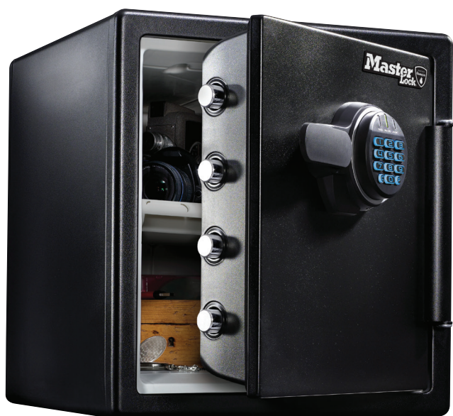
1 Hour Digital Fire Safe X Large