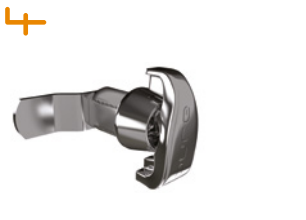
Secure hasp lock This hasp offers a higher level of security over the standard hasp and also adds a touch of style to your locker.