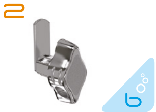
Standard hasp lock This stylish hasp allows the use of a padlock with a maximum shank diameter of 7mm, minimum 5mm. Padlock sold separately.