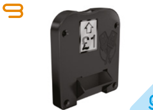
£1 coin/token return or retain These self-service locks are simple and easy to use. This lock is available in two modes; coin return and coin retain (retain if used with the additional Coin box, opposite). In both modes the lock is controlled using a master key, available separately.