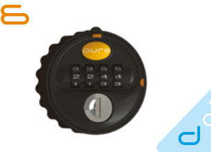
4 digit re-programmable lock Available set as public mode , this 4 wheel mechanical combination lock features up to 10,000 unique combinations. For additional security the combination lock is also available with an optional 'twist resist' feature.