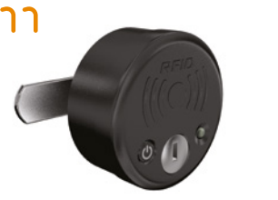
RFID contactless circular lock This is an environmentally friendly, low energy system using just one standard, easy to change, 1.5V AA battery. The transponder is available in cards, tags or wristbands. All transponders are easy to programme to master or user. Suitable for dry environments only. Master key available.