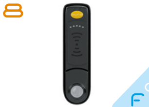
RFID contactless digital lock High strength Grivory makes this lock very robust, the lock can be used independently or paired with existing wireless systems. Steel override key available to bypass the contactless locking feature when immediate supervisory access is necessary.