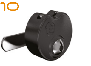
£1 door front coin return lock £1 coin return lock offers a simple and cost effective solution for multiple occupancy locker/compartments. Ideal for use in changing rooms and general public areas. Can be retro fitted to most Pure locker doors. Lock supplied with two keys. Suitable for dry environments only. Master key available.