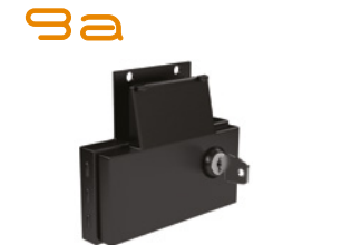
Optional coin retain box The Coin Box P004 attaches to the rear of the coin operated lock and retains any coins that are used to operate the lock.