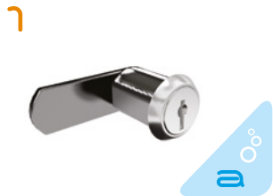
Standard cam lock Our standard cam lock features 3000 serial combinations. Two keys are supplied with this lock.