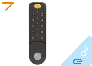
Digital combination Lock With a solid zinc alloy housing, 10-digit keypad, a secure key override as standard, the Zenith digital lock is the perfect choice for a wide variety of applications.