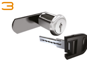
Premium cam lock with plastic key fob Our high security premium cam lock features double entry key access and offers a higher level of security.