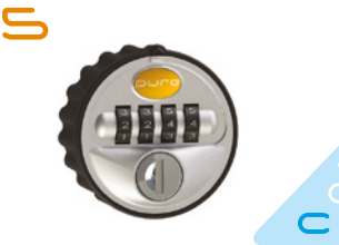
4 digit re-programmable lock Available set as private mode , this 4 wheel mechanical combination lock features up to 10,000 unique combinations. For additional security the combination lock is also available with an optional 'twist resist' feature.