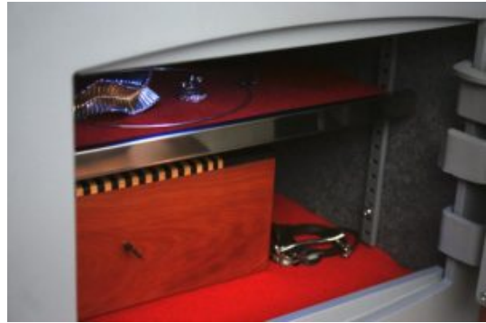
Mini Vault Jewellery Shelf