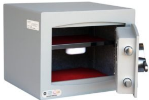
Mini Vault 1 S2 Silver Electronic Locking