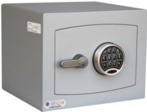
Mini Vault 1 S2 Silver Electronic Locking