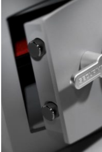
Mini Vault Bolts & Handle