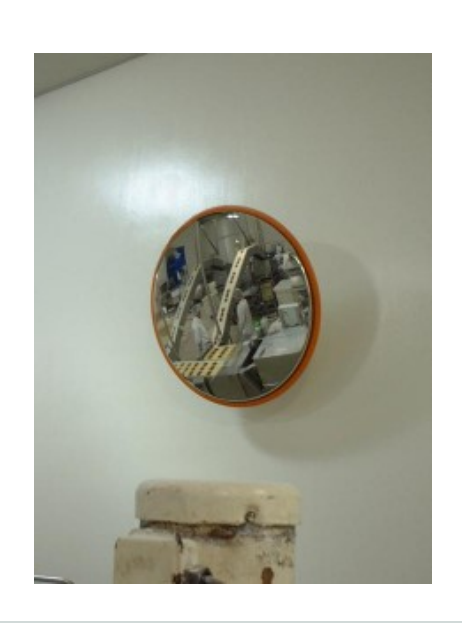
800mm Acrylic Food Processing Mirror