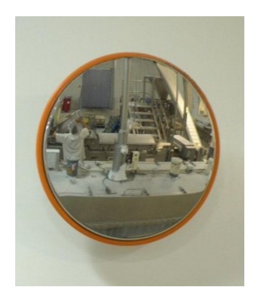
800mm Acrylic Food Processing Mirror