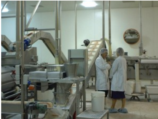
600mm Acrylic Food Processing Mirror