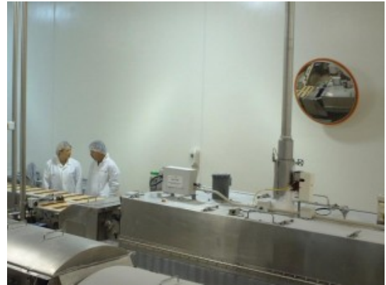
600mm Acrylic Food Processing Mirror