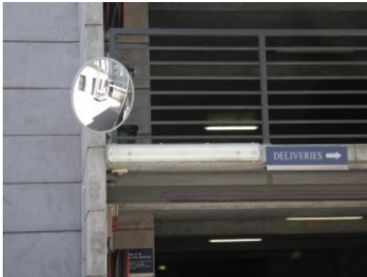
600mm Heavy Duty Exterior Mirror