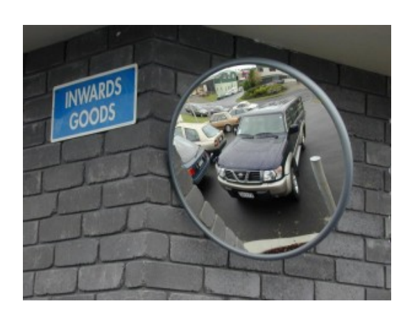
450mm Heavy Duty Exterior Mirror