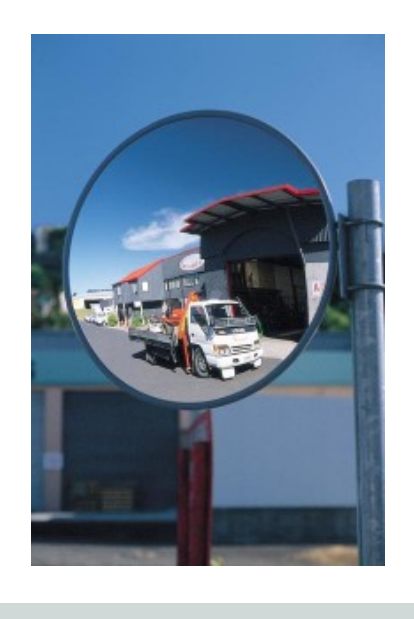
450mm Heavy Duty Exterior Mirror