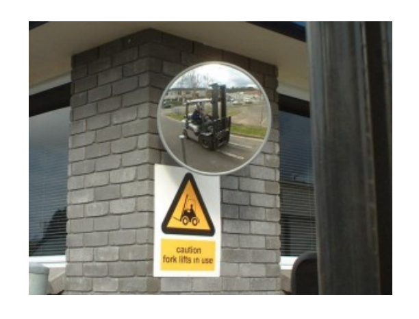
450mm Heavy Duty Exterior Mirror