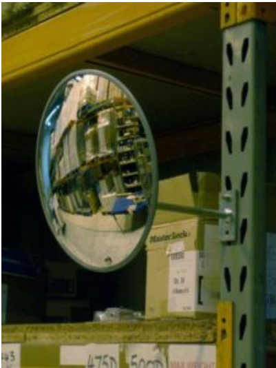
300mm Acrylic Budget Indoor Mirror