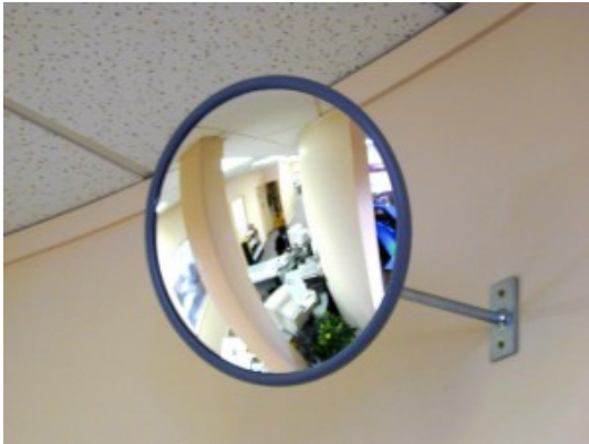
300mm Acrylic Interior Mirror