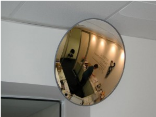
300mm Acrylic Interior Mirror