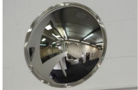
500mm Stainless Steel Wall Dome Mirror