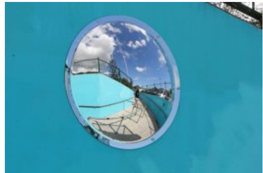
500mm Stainless Steel Wall Dome Mirror