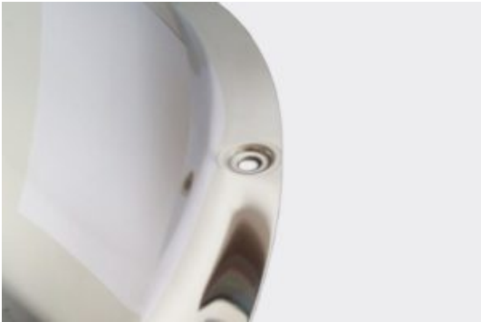
Fixing Detail - 500mm Stainless Steel Wall Dome Mirror