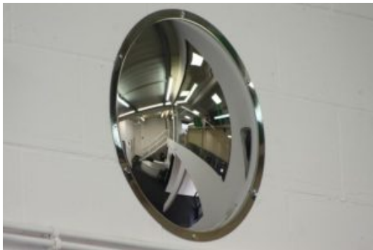
500mm Stainless Steel Wall Dome Mirror