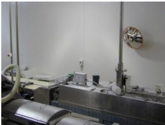
450mm Stainless Steel Food Processing Mirror