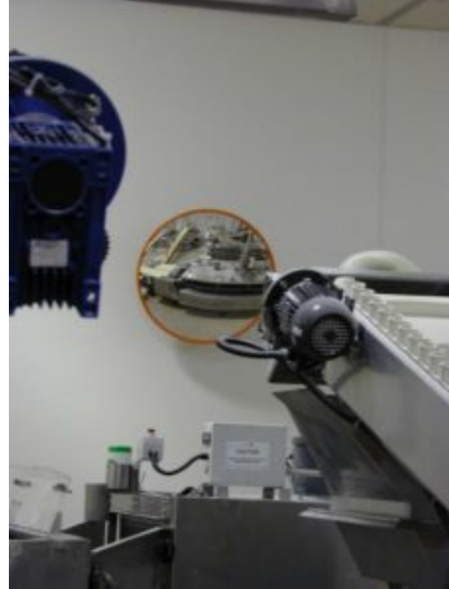
450mm Stainless Steel Food Processing Mirror