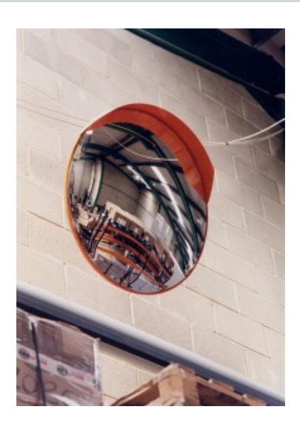
600mm Stainless Steel Anti-Vandal Mirror