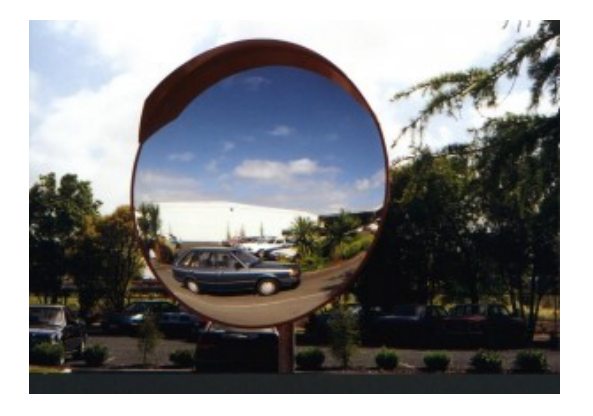
600mm Stainless Steel Anti-Vandal Mirror