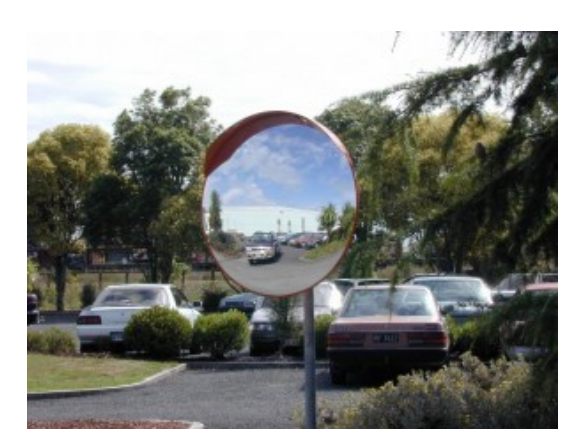
600mm Stainless Steel Anti-Vandal Mirror