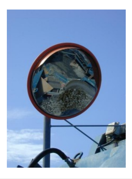
600mm Stainless Steel Anti-Vandal Mirror