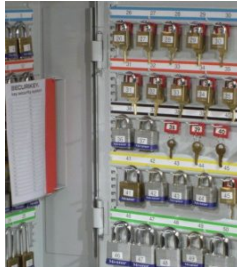
Key Vault Padlock Interior