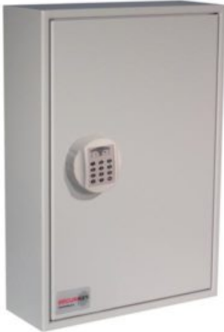
Key Vault Padlock 50 Electronic Lock REVO A