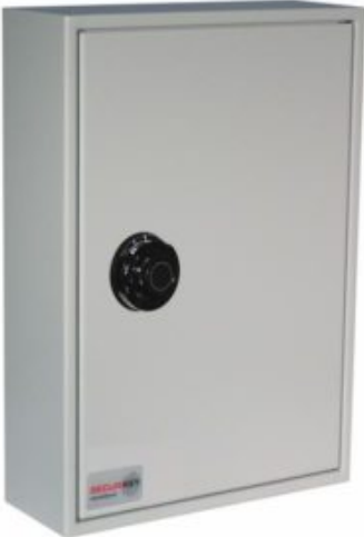
Key Vault Padlock 50 Dial Combination Lock