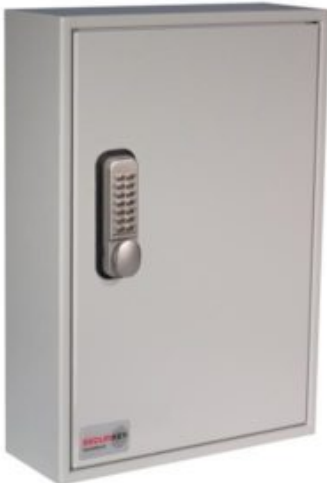
Key Vault Padlock 50 Push Button Combination Lock