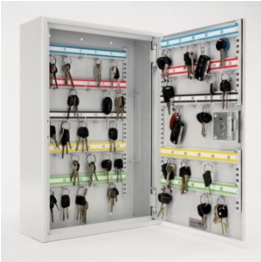
Key Vault Padlock 50