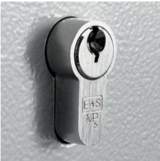
Euro Profile Cylinder