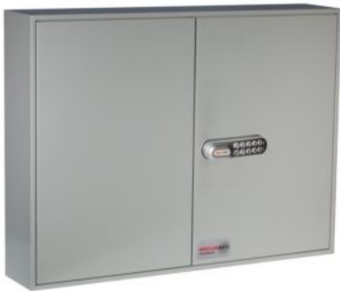
System 100 Padlock CL1000 Electronic Cam Lock