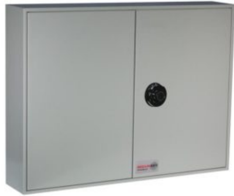
System 100 Padlock Dial Combination Lock