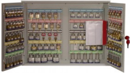
System 100 Padlock