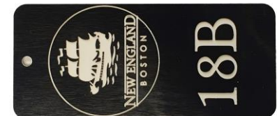
The image shows Hotel Key Fob