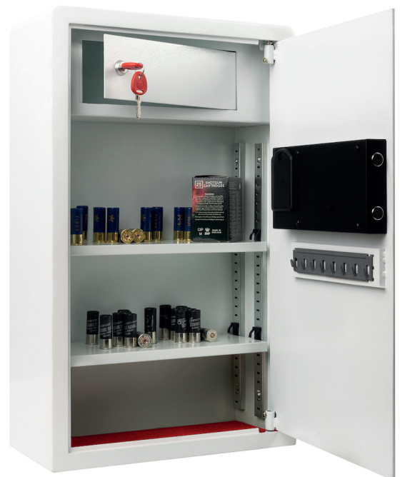
Ammunition Cabinet 200