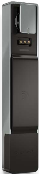
Surface Mount Hybrid Knob on Top