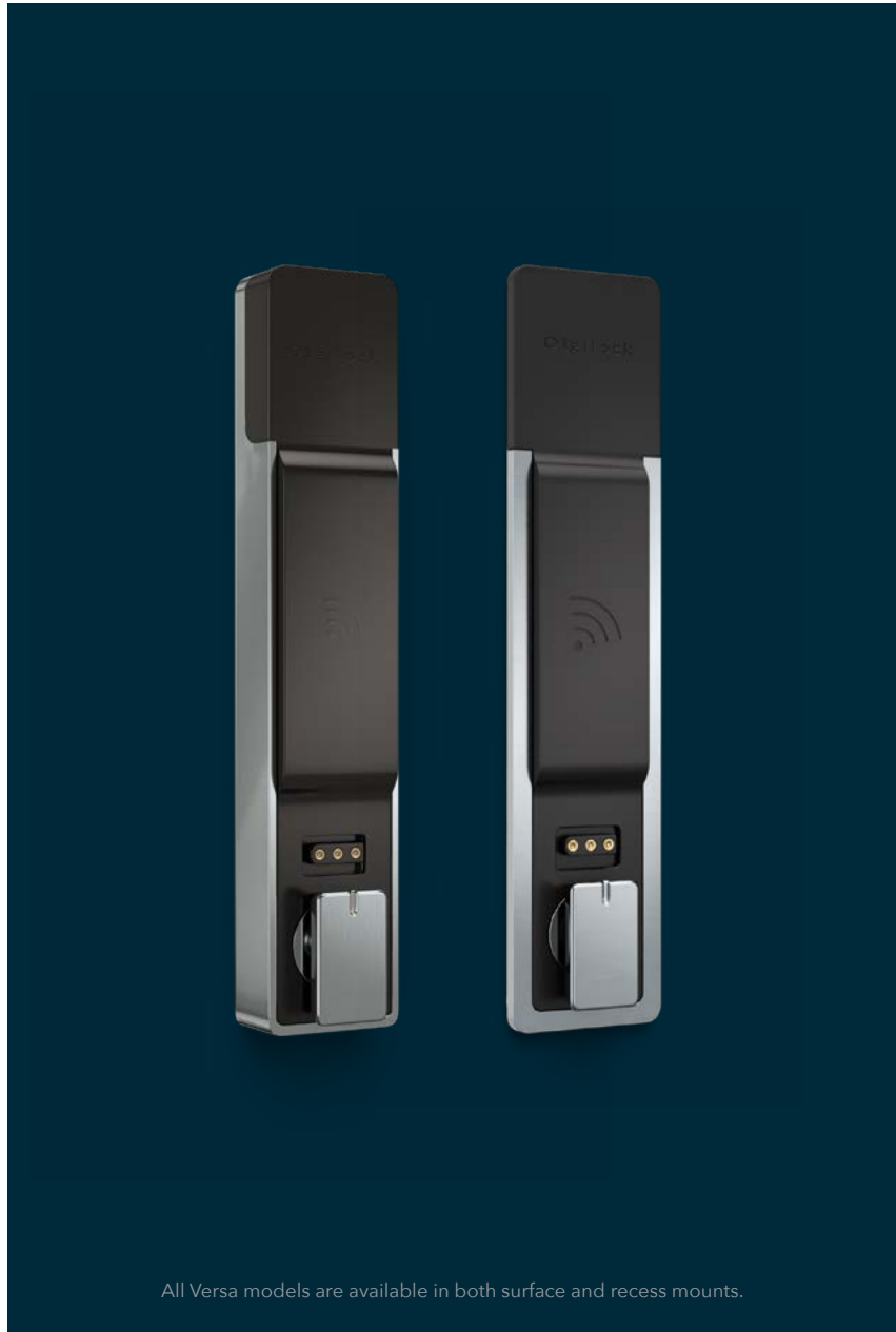
All Versa models are available in both surface and recess mounts.