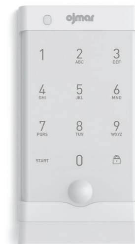
OCS®SMART White Handle