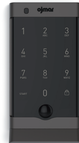
OCS®SMART Graphito Handle