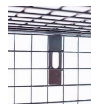
Rear Fixing Brackets