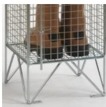
150mm base with Fixing Brackets