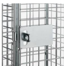
Hasp & Staple Locking