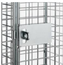
Hasp & Staple Locking