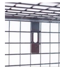
Rear Fixing Brackets