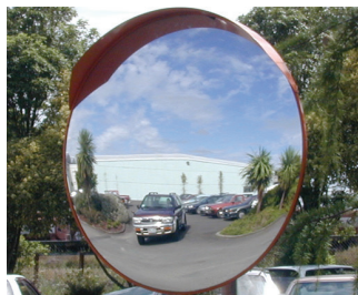
Deluxe Heavy Duty